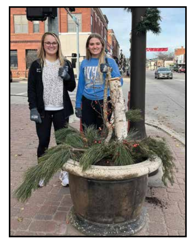
The pots along Main Street look festive thanks to the FFA members and Plant Science students!